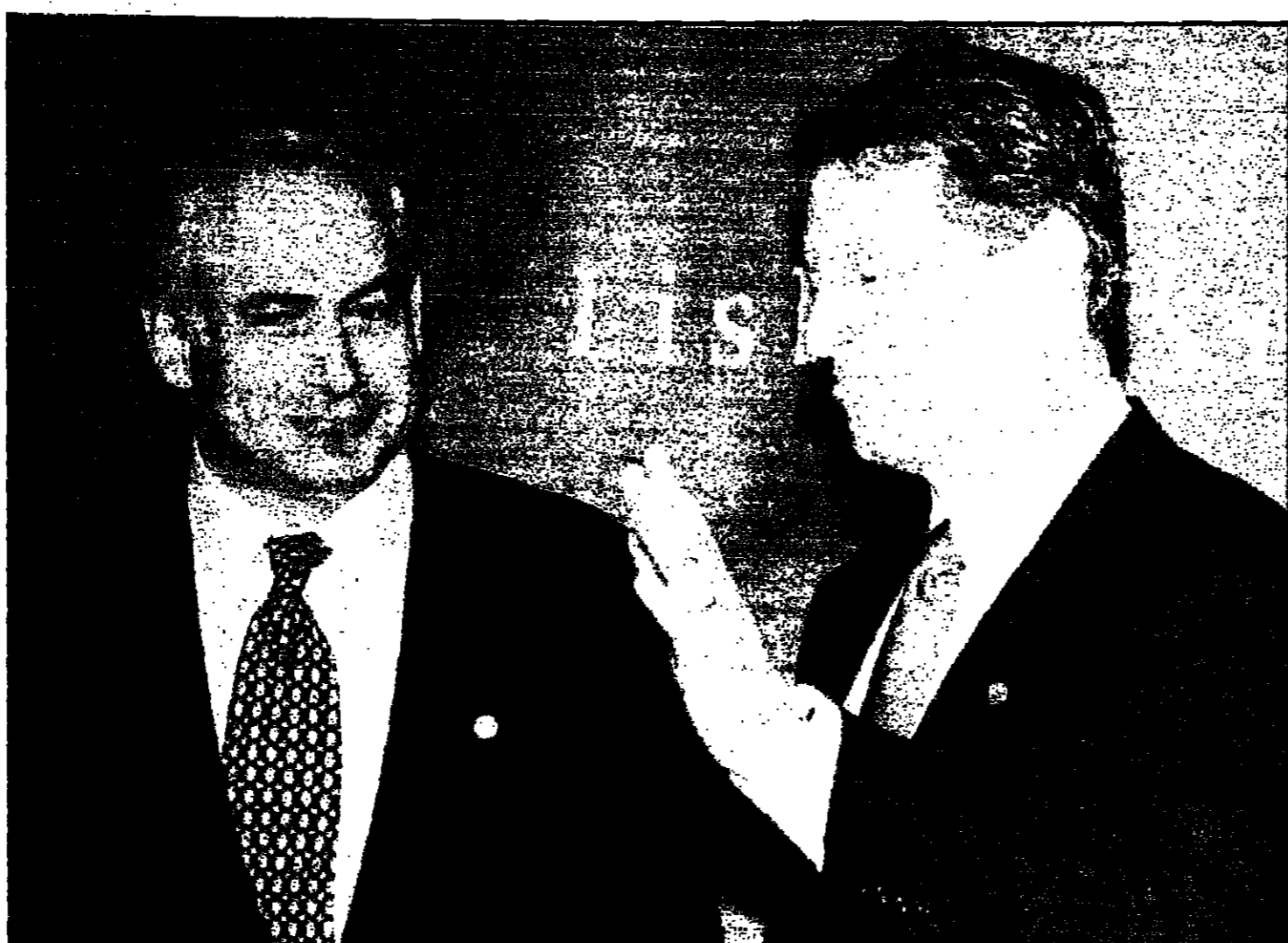
Prime Minister Binyamin Netanyahu and US Vice President Al Gore share a light moment at the CSCE meeting in Lisbon yesterday.

Labor MK Yossi Beilin, who has had talks with Likud MK Michael Eitan lately on the end goals in the negotiations with the PA, contributed to the speculation last night by asserting that "there is much more in common than is supposed. There is a surprising amount of common ground."